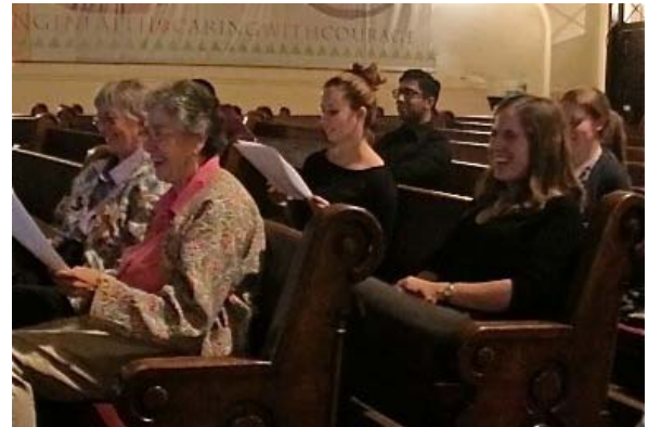
Moviegoers sing along with the songs in the movie "Sister Act"